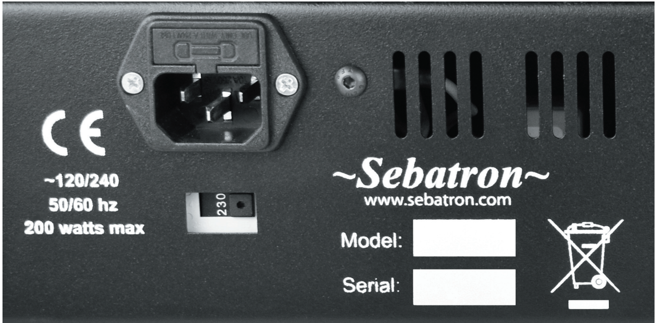
Voltage Selector Switch

The Thorax can be switched between different voltages via the voltage mains selector on the back of the unit.